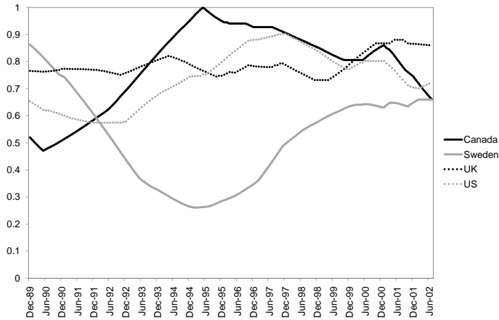
FIG. 1. Development of the indicator of effective monetary policy conservatism, December 1989–July 2002